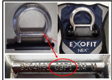
Step 1 Manufacture Date on Harness Shown in Red Circle – must be between 16/01 (2016, January) and 18/12 (2018, December)